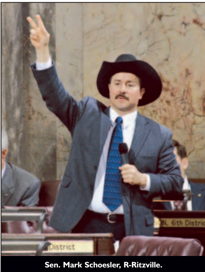
Sen. Mark Schoesler, R-Ritzville.

This bill attempted to change the structure of property tax levies for school funding and would have authorized schools to use voter approved school levies for cost of living adjustments for teachers. While the bill did pass the House on a mostly party line vote, AWB was able to block them from passing the Senate.