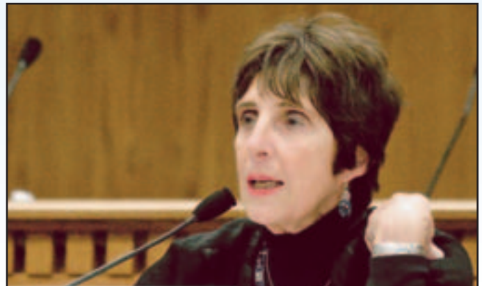
Sen. Rosemary McAuliffe, D-Bothell.

This bill provided that cities and counties would include best available science by indicating the specific policies and regulations along with the sources of scientific information. The bill also created a lengthy, detailed procedure for public comment and final adoption of written management recommendations by the Department of Community Trade, and Economic Development, which local government could choose to follow. In doing so, local