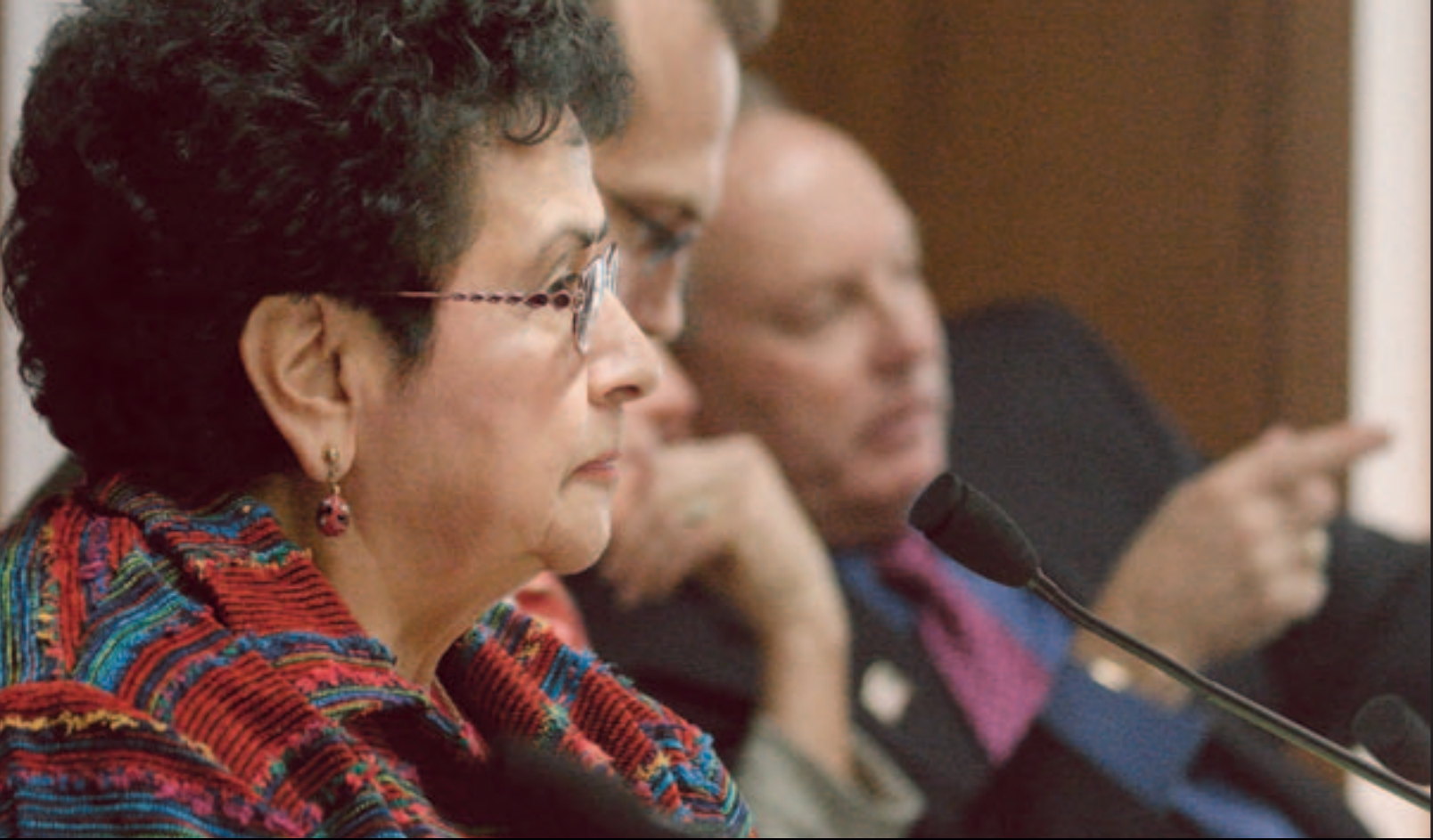
Sen. Margarita Prentice, D-Renton.